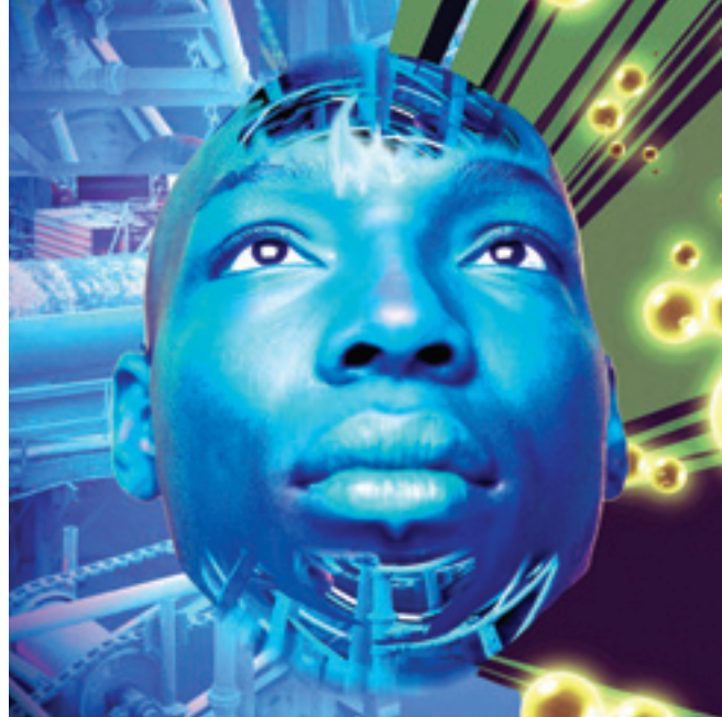
ILLUSTRATION: PATRICK TUCKER, WFS

In our brains, nanobots will interact with our biological neurons. This will provide full-immersion virtual reality incorporating all of the